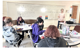
THE Z-FACTOR LEADERSHIP PROGRAM