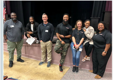
Sheffield High School