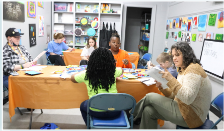
ARTS AND CRAFTS CLASS

We appreciate the support of each one of our partners and sponsors. Through your willingness to give it allows us to support and reward the mentees with monthly and quarterly outings as well as small tokens on their birthdays, through making good grades, having positive attitudes and weekly