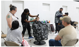
100 FREE HAIRCUTS "GROOMING FOR SUCCESS"