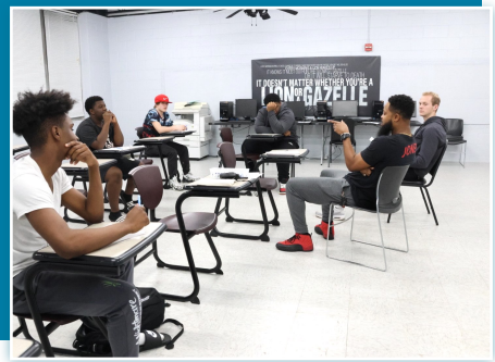
GROUP LEARNING SESSIONS

participation. It allows us to support them in ways they need and introduce them to new experiences. It gives us pleasure to say we are continuing to grow to the point we need additional means of transportation to accommodate all the kids that want to be a part of what we are building!