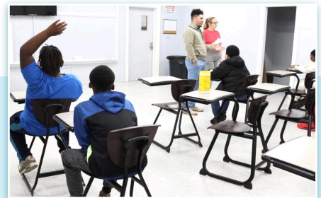
FINANCIAL LITERACY CLASS