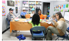
JUMP JUVENILE UPLIFTING MENTOR PROTECT