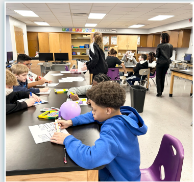
LE Wilson Elementary